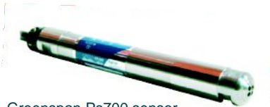
Greenspan Ps700 sensor