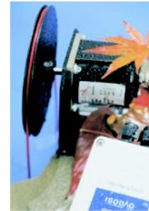
Thisle shaft encoder